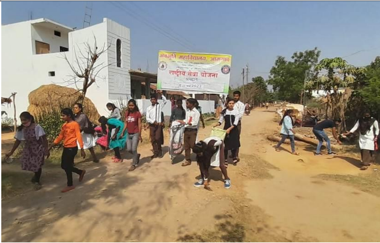
Plastic and garbage cleanliness activity by NSS during NSS special camp at village Jamkhari, Tahsil Amgaon