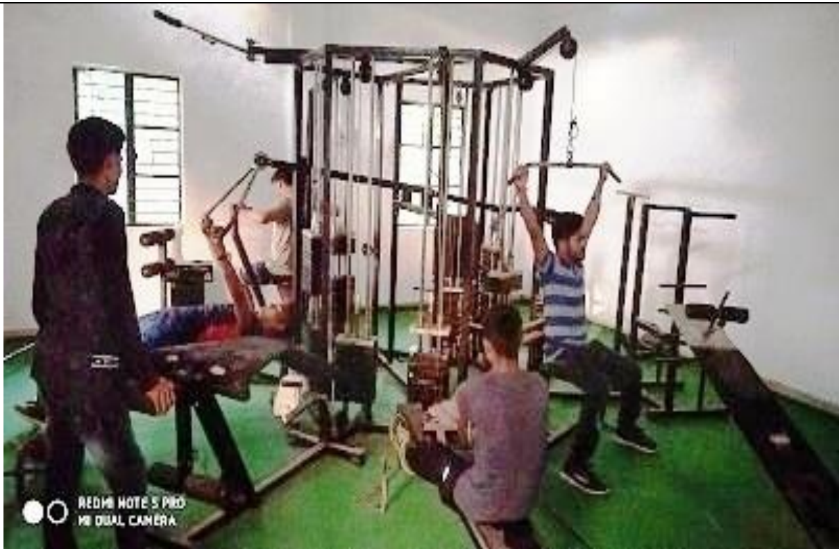
Regular and External Students doing exercise in Gymnasium