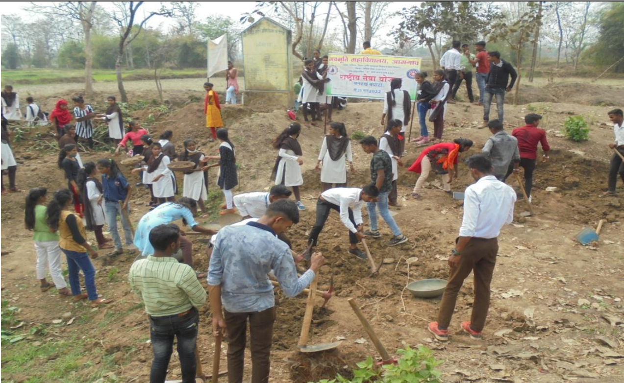
Labor activity of NSS students to built a clay barrier at village canal at the village Jamkhari, Tahsil Amgaon, during NSS special camp