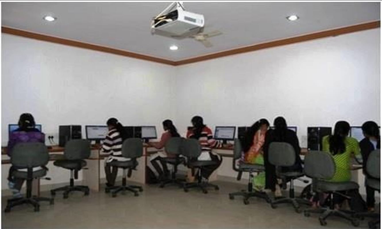
Students searching online material in the E-library