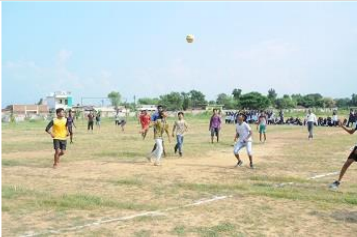
Participation of under 16 age group students at Tahsil level inter-school tournament of various games organized on college ground