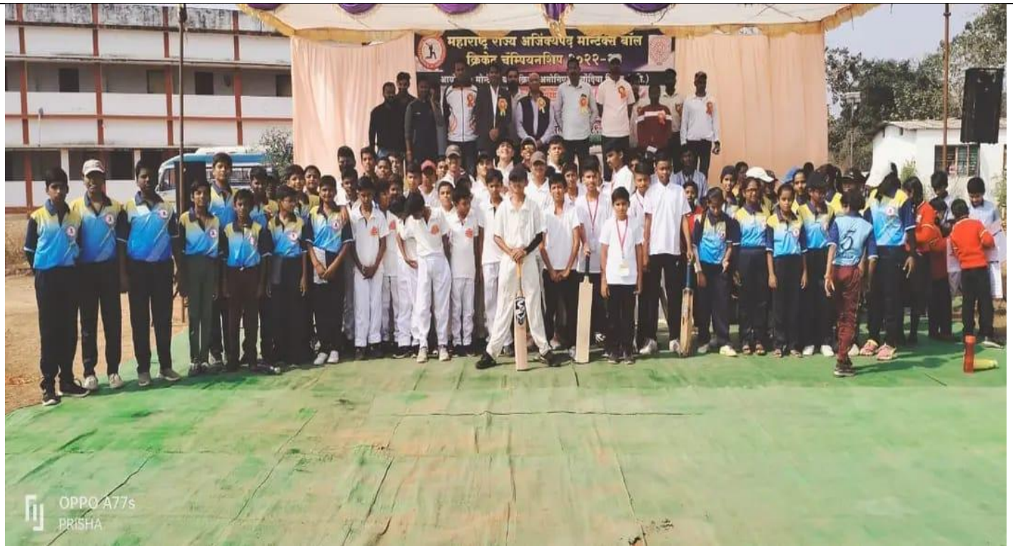
12th State level cricket championship matches, played on the huge ground of Bhawabhuti Mahavidyalaya, Amgaon. A group photo after inauguration of the event.