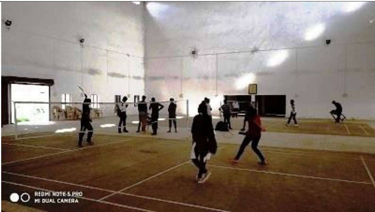
Students practicing games in the indoor sports hall