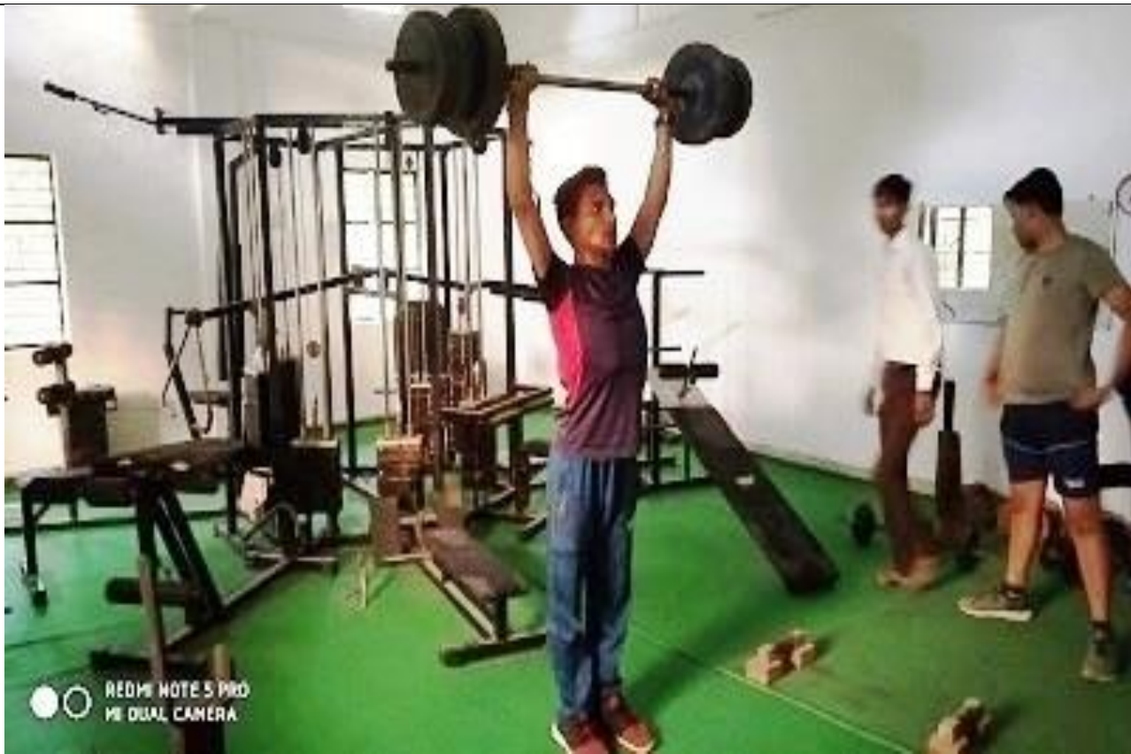
Regular and External Students doing exercise in Gymnasium