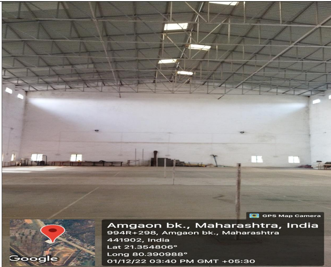
Indore Sports Hall