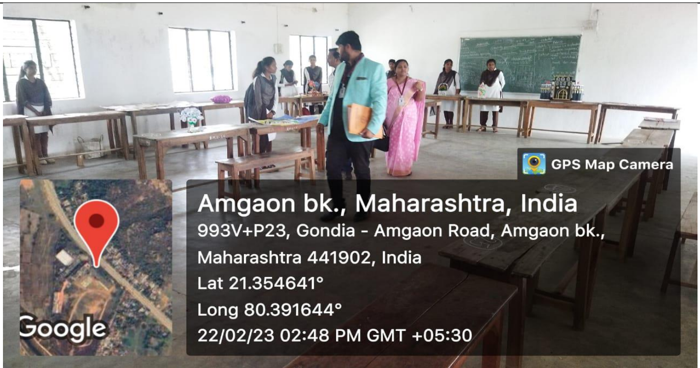
Students' participation in Best from Waste Activity (Craft Exhibition) under Hobby workshop